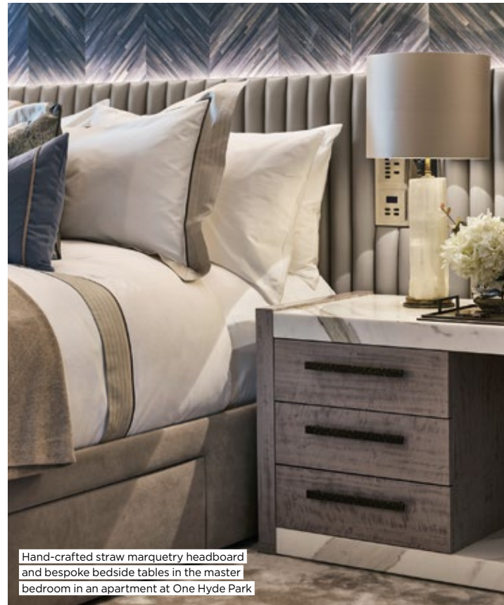
Hand-crafted straw marquetry headboard and bespoke bedside tables in the master bedroom in an apartment at One Hyde Park

From a private villa in Kuwait with subtle joinery elements that integrated the family monogram to lighting installations featuring rock crystal, artisan metal work and alabaster, Elicyon sets no limit on luxury. As much as Elicyon works in design, travelling to Basel, Paris and New York to buy art or Italy to choose marble for clients, they also excel