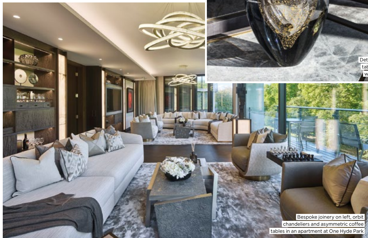
Bespoke joinery on left, orbit chandeliers and asymmetric coffee tables in an apartment at One Hyde Park