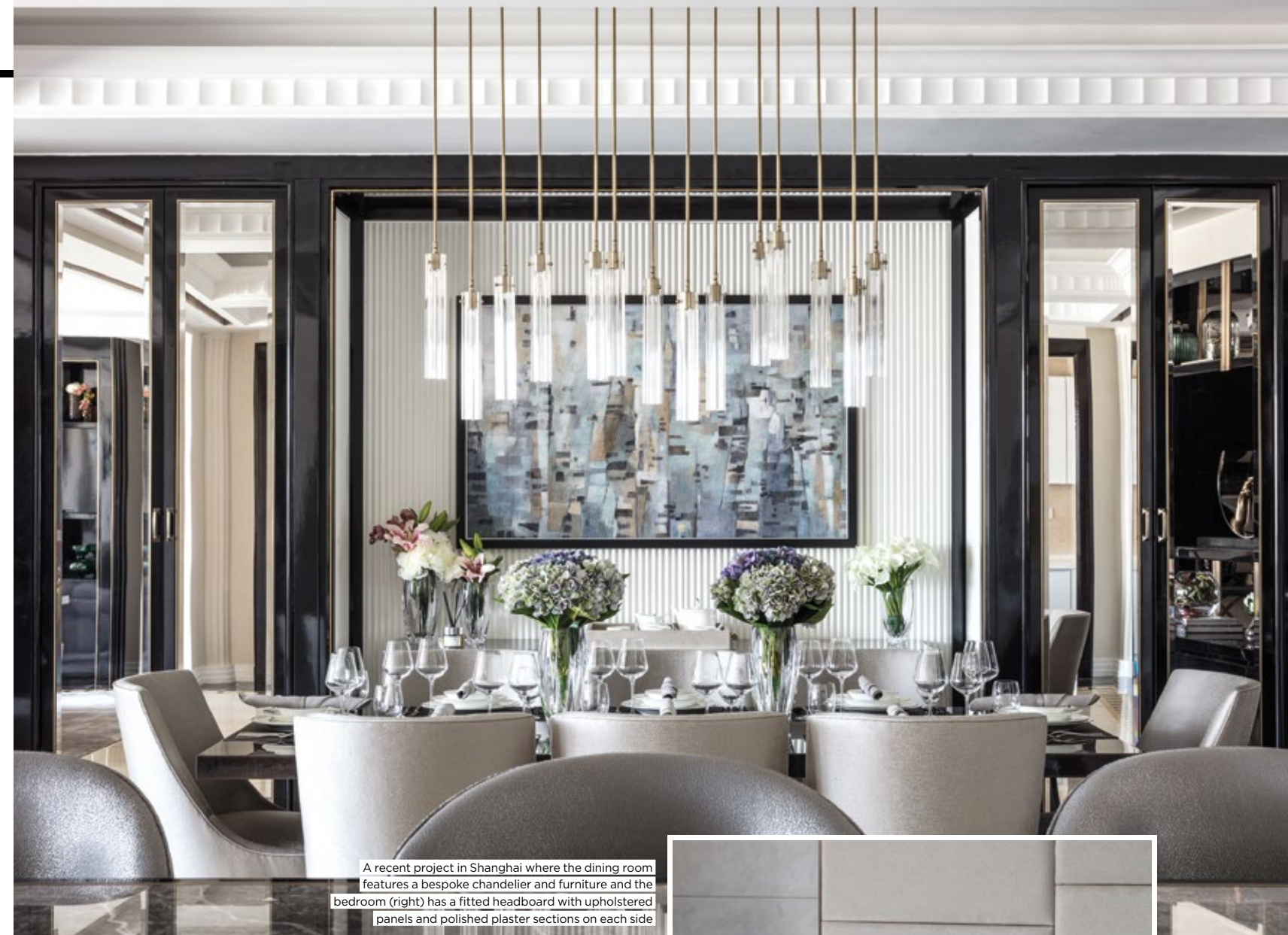
A recent project in Shanghai where the dining room features a bespoke chandelier and furniture and the bedroom (right) has a fitted headboard with upholstered panels and polished plaster sections on each side