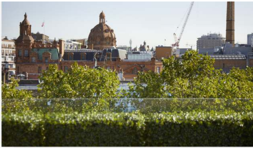
You can almost peer into Harrods from the penthouse's roof terrace